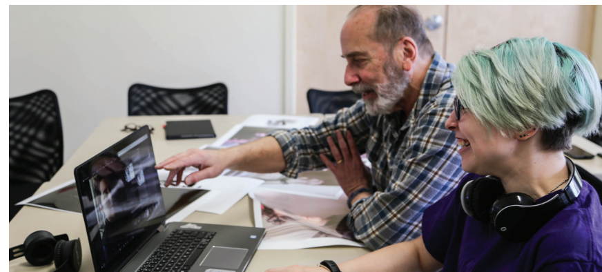
► PAL faculty help students use technology to become strong independent learners.

Please make your gift by visiting www.Curry.edu/give and selecting PAL 50th Anniversary.