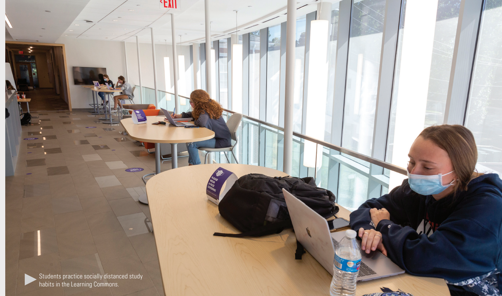
▶ Students practice socially distanced study habits in the Learning Commons.