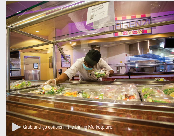
▶ Grab-and-go options in the Dining Marketplace.