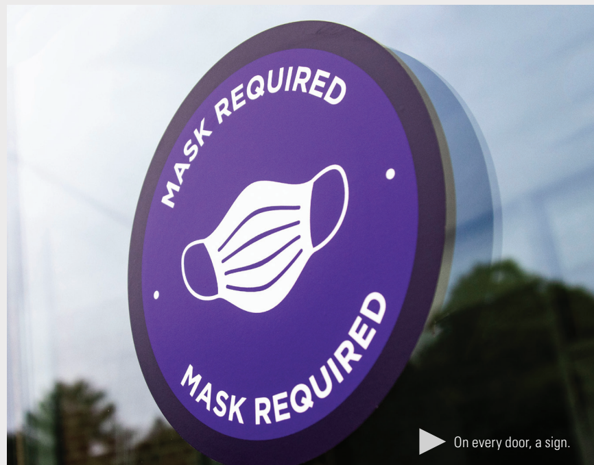
▶ On every door, a sign.