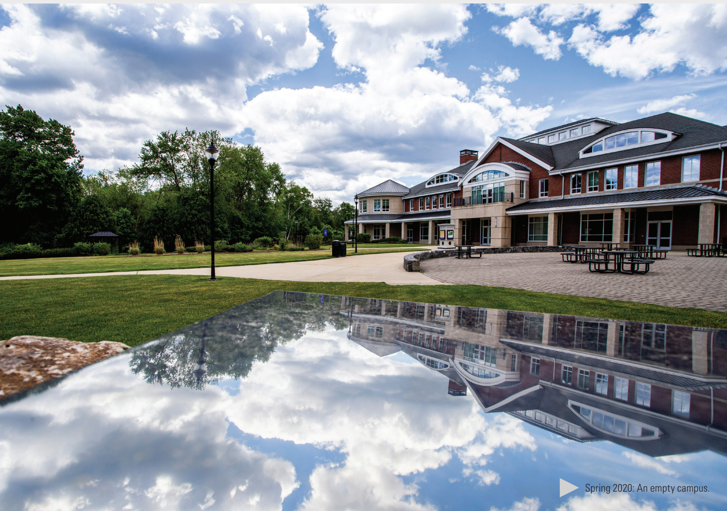
▶ Spring 2020: An empty campus.

dear and devoted people at Curry – now represented as masked but smiling faces, or encouraging voices on phones and screens – have remained the anchor to the College’s perseverance through the global health crisis. Through challenge and hardship, the coronavirus has only strengthened the community’s commitment to one another, as faculty, students, staff and alumni have discovered new ways to thrive in uncertain times.