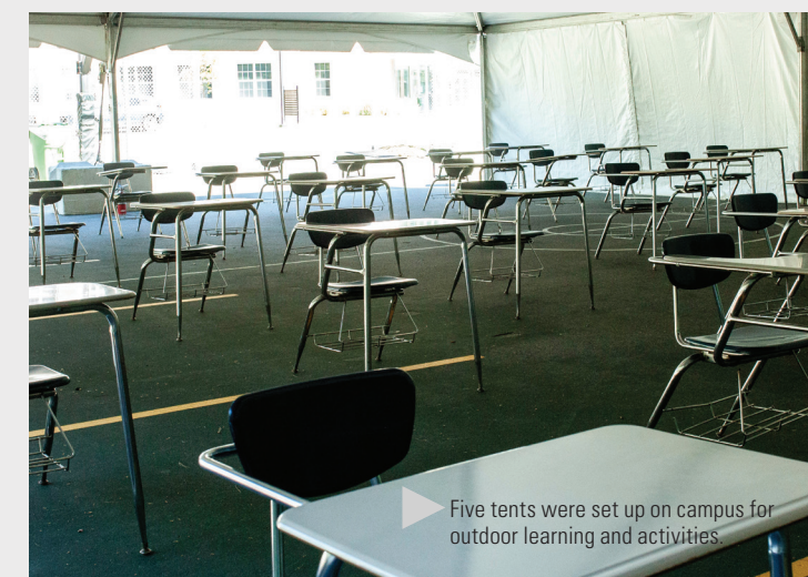
▶ Five tents were set up on campus for outdoor learning and activities.