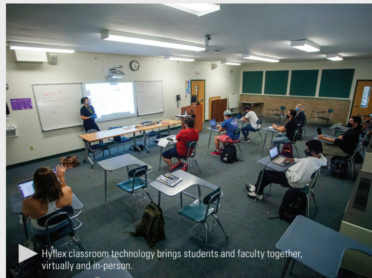
▶ Hyflex classroom technology brings students and faculty together, virtually and in-person.