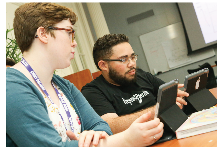
PAL students work together collaboratively in small groups.